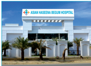
Asian Haseena Begum Multi Speciality Hospital, Sambhal