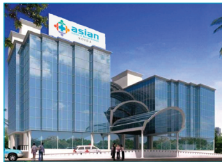
Asian Institute of Medical Sciences Noida