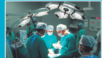
Asian Centre for Surgery