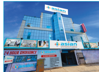
Asian Yamuna Vihar Multi Speciality Hospital, New Delhi