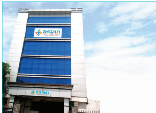
Asian City Hospital, Patna