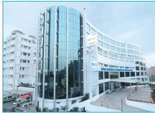
Asian Institute of Medical Sciences Faridabad

Asian Healthcare Group is one of the fastest growing healthcare chains in the country. In a short span of 9 years, it has created a niche for itself in the states of Delhi, Haryana, UP, Bihar and Jharkhand through its philosophy of affordable, accessible and best available healthcare for people close to where they live. The group's flagship hospital, Asian Institute of Medical Sciences, Faridabad continues to be India's premier healthcare destination at par with the best in the world.