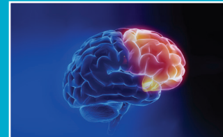
Asian Neuro Centre