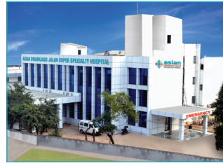
Asian Dwarkadas Jalan Super Speciality Hospital, Dhanbad