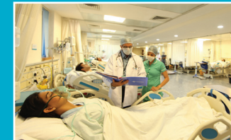
Asian Centre for Urology