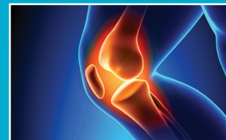
Asian Centre for Bone & Joints