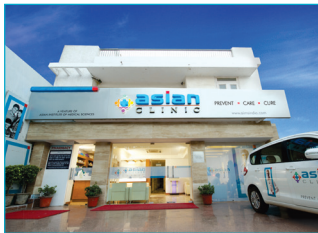
Asian Clinic GK-1, Palwal, Faridabad