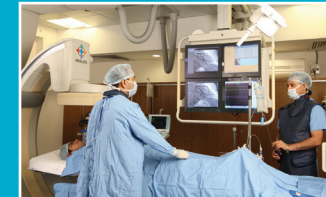
Asian Heart Centre