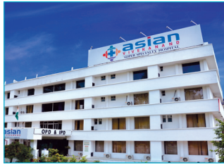
Asian Vivekanand Super Speciality Hospital, Moradabad