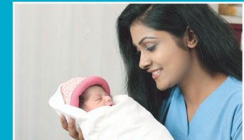
Asian Centre for Mother & Child