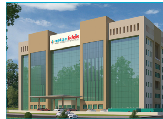
Asian Fidelis Multi Speciality Hospital Greater Faridabad