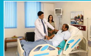
Asian Dialysis Centre